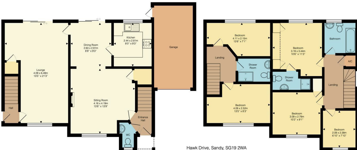
Hawk Drive, Sandy, SG19 2WA Approximate Total Area: 133.6 m 2 ... 1438 ft 2 (excluding garage) This plan is for illustrative purposes only. Measurements and positions of doors, windows, and fixtures are approximate and should not be relied upon.