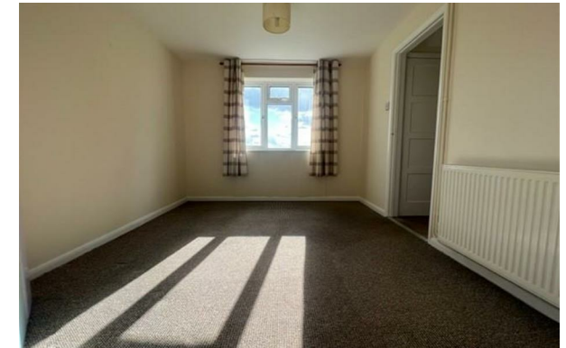
3 Grange Farm Cottages, Newport Pagnell Road, Stagsden, £1,200 PCM