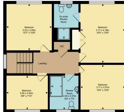
Wingfield Drive, Potton, SG19 2GQ

This plan is for illustrative purposes only. Measurements and positions of doors, windows, and fixtures are approximate and should not be relied upon.