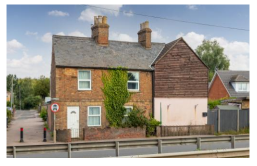
High Road Beeston, Sandy, SG19 1NS