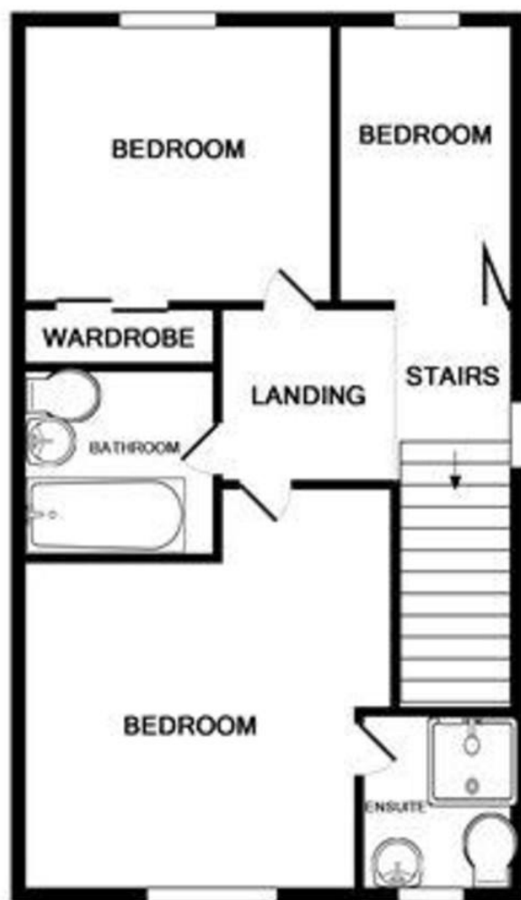
1ST FLOOR APPROX. FLOOR AREA 474 SQ.FT. (44.0 SQ.M.)

TOTAL APPROX. FLOOR AREA 948 SQ.FT. (88.1 SQ.M.)